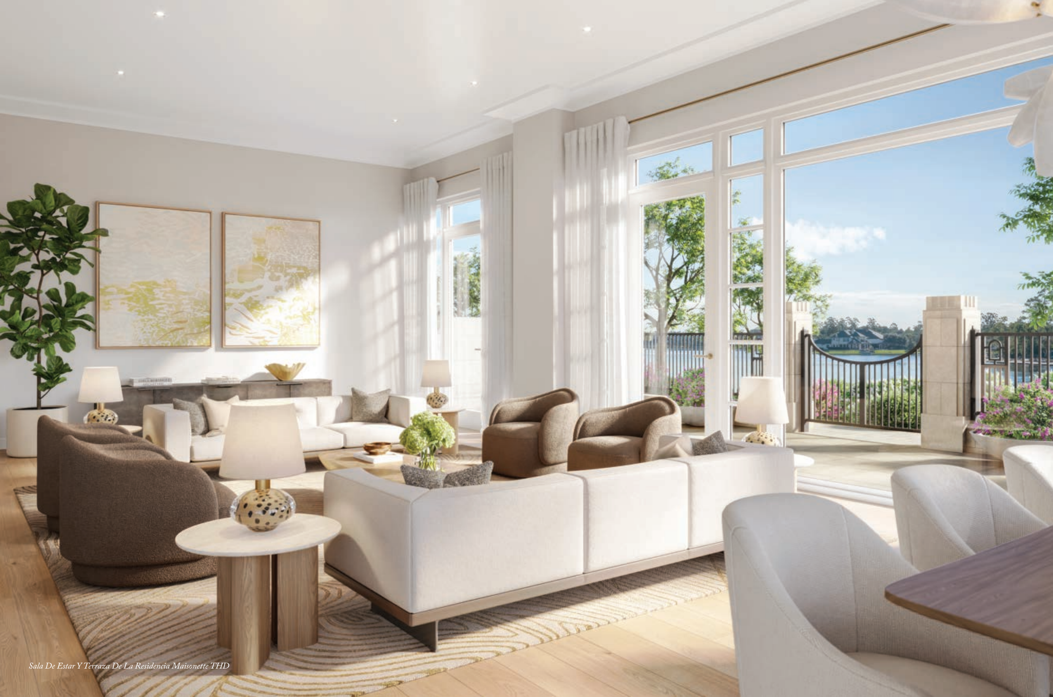
Sala De Estar Y Terraza De La Residencia Maisonette THD