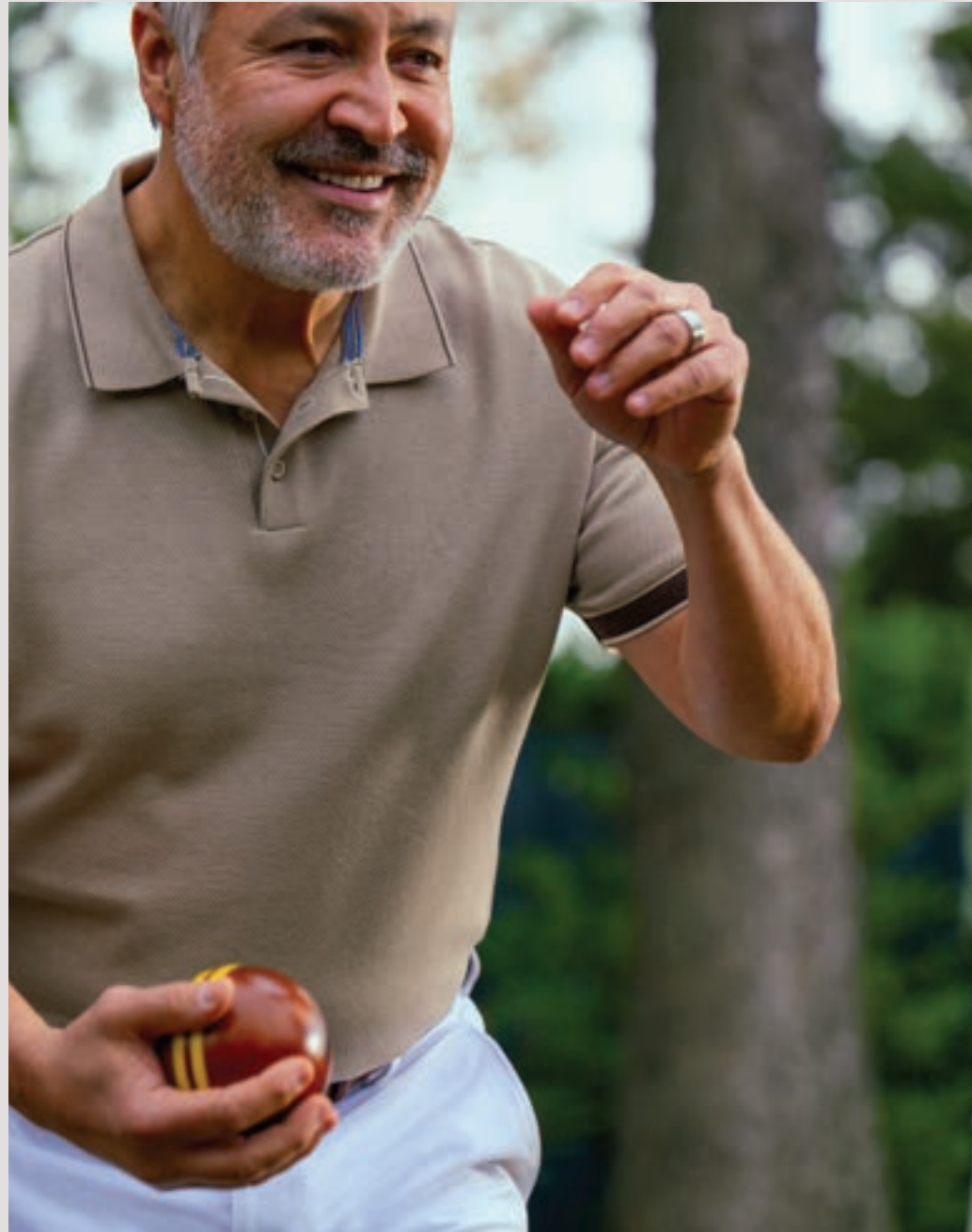
Actividades recreativas a lo largo del lago