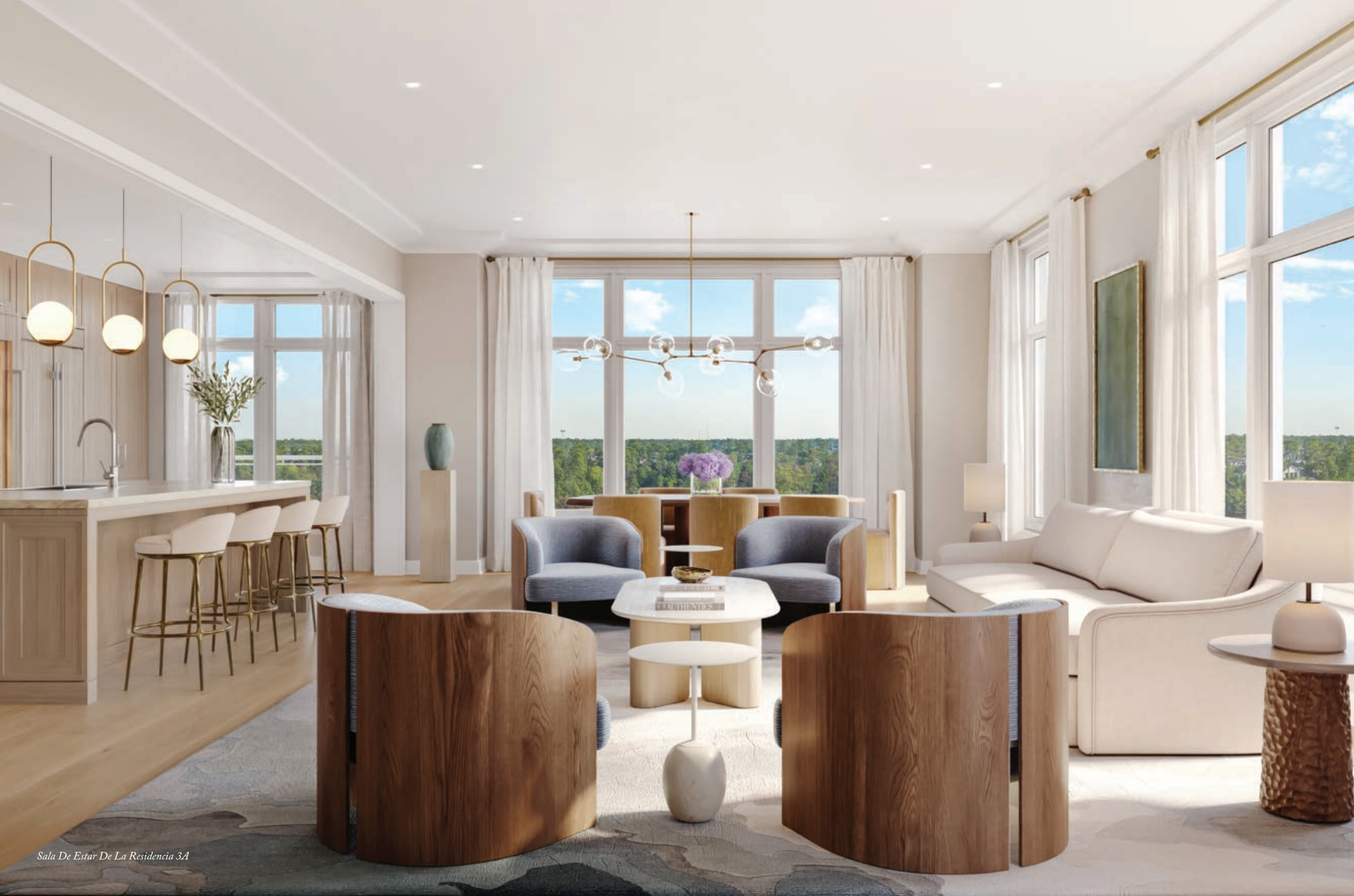
Sala De Estar De La Residencia 3A