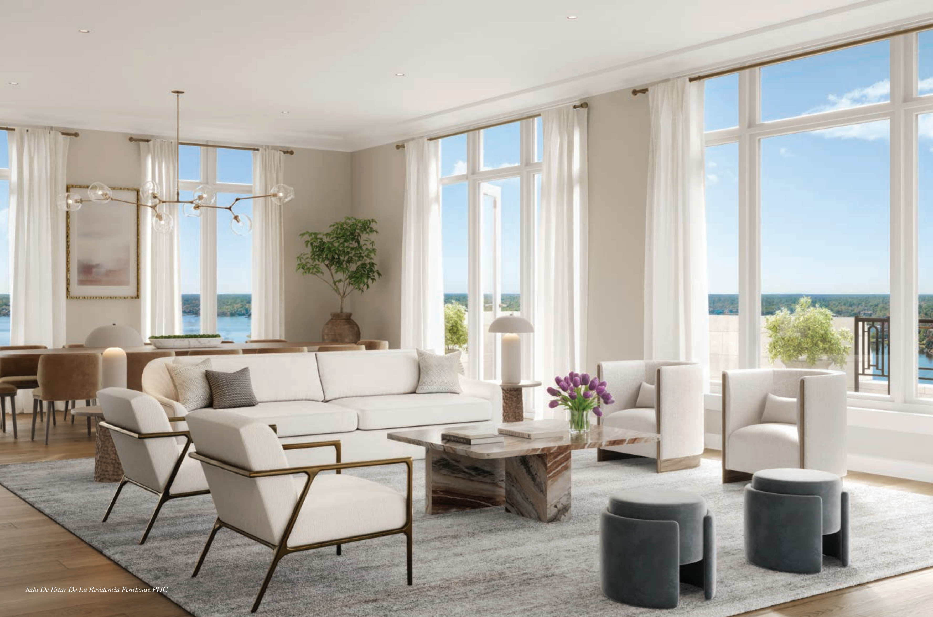
Sala De Estar De La Residencia Penthouse PHC